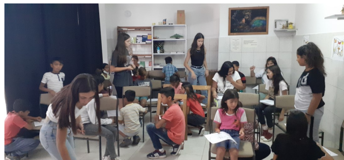
Children's Class, Roma Church in Kavadarci

Several people from their churches finished their training at Royal Rangers. Pray that they may be involved actively and start new outposts, in their cities.