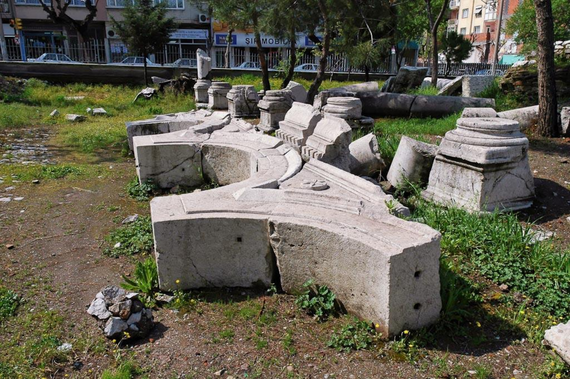
Thyatira colonnaded road and arches