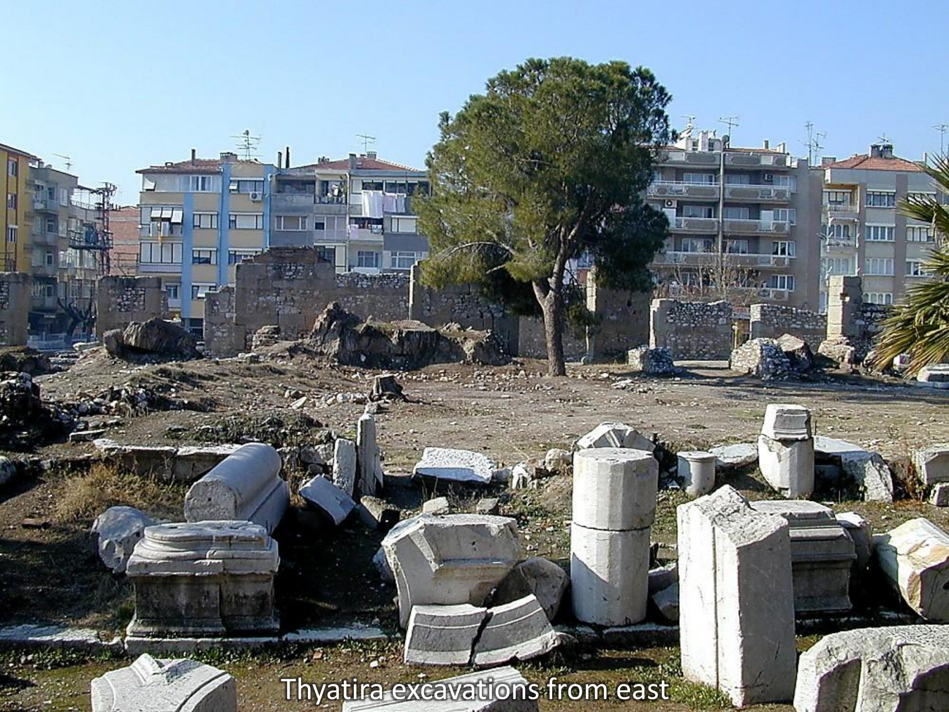
Thyatira excavations from east